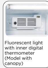
Fluorescent light with inner digital thermometer (Model with canopy)